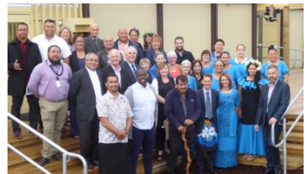
Image: Team at the blessing of the new Pan Pasifika Barnardos ECE Centre

Congratulations to the team involved in the new Pan Pasifika Barnardos ECE Centre in Hornby; thank you for all the work you have done. The centre was blessed on 17 February, and is licensed for 50 children.