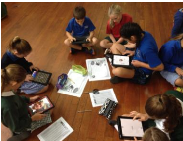
Image: Identifying personal leadership qualities

The Hereora Learning Community Cluster truly appreciated the team of adults that helped out on the day which included teachers and youth workers. There were 80 youth leaders from across all sectors ECE, primary, intermediate and high school. These events are made possible because schools are committed to sending along students to participate.