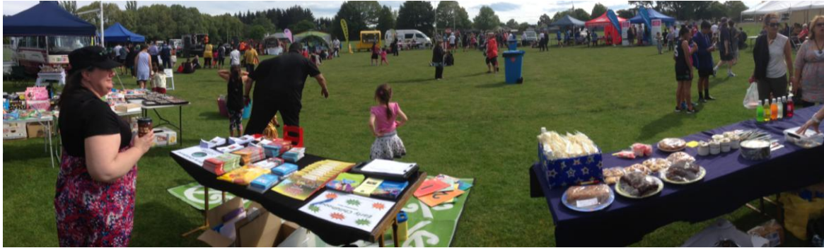
Image: 'Hoon Hay Fiesta'

Te Puawaitanga Ki Ōtautahi Trust (TPKOT) joined local whānau, organisations and businesses at the recently held 'Hoon Hay Fiesta'. TPKOT used the opportunity to engage with whānau and promote their early childhood transition programme.