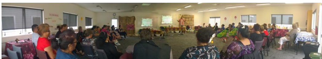
Pasifika leaders from the community sharing their leadership stories with teachers